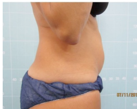
Clinical effectiveness 18 weeks post treatment 18週治療後臨床顯示照片