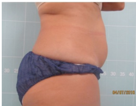
Clinical effectiveness baseline 治療臨床顯示照片